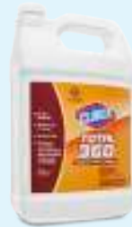
4/128 oz. Gallon UPC: 31650