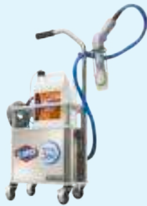
1 Unit UPC: 60010